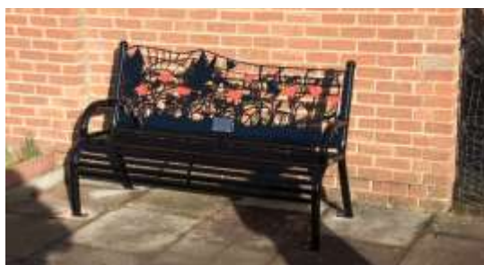
100th Anniversary Memorial Bench