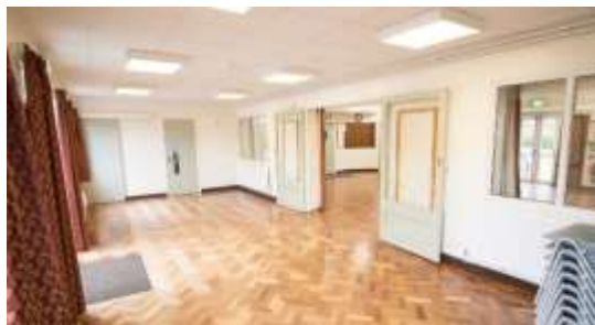
The Nicholls Room