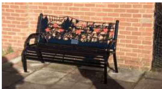
100th Anniversary Memorial Bench