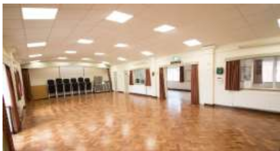
The Main Hall

The grassed garden at the side of the hall also provides an ideal area for a marquee to expand further the space available.